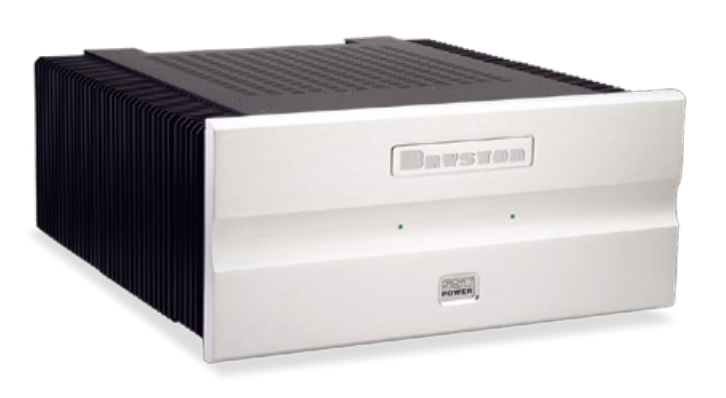
The 14B SST<sup>2</sup> is also available in a special 120 Volt 20 Amp version (requires a dedicated 20 Amp AC outlet).